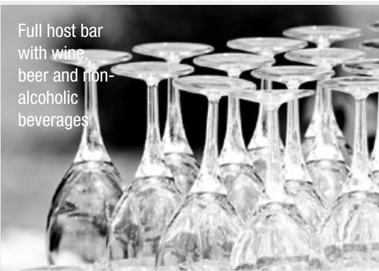
Full host bar with wine, beer and non-alcoholic beverages