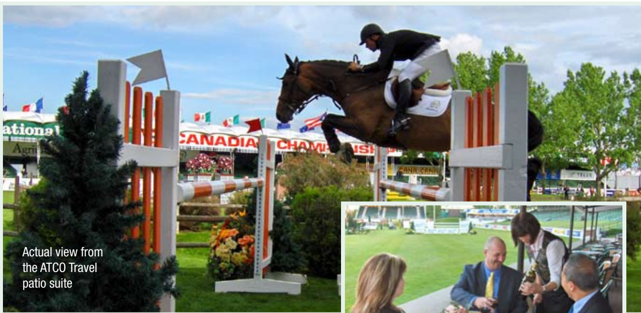
Actual view from the ATCO Travel patio suite