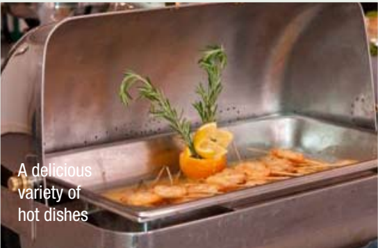
A delicious variety of hot dishes