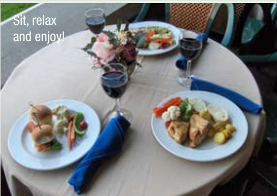
Sit, relax and enjoy!